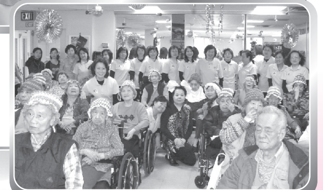
Ladies Leisure Club Makes Hats for Seniors