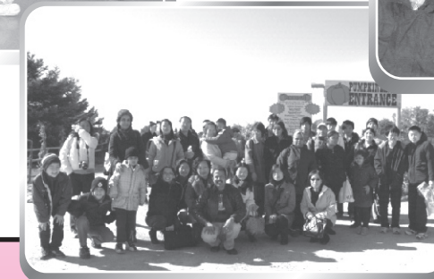
Host participants take a trip to Pumpkinland