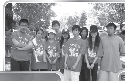
Toronto International Dragon Boat Race Festival