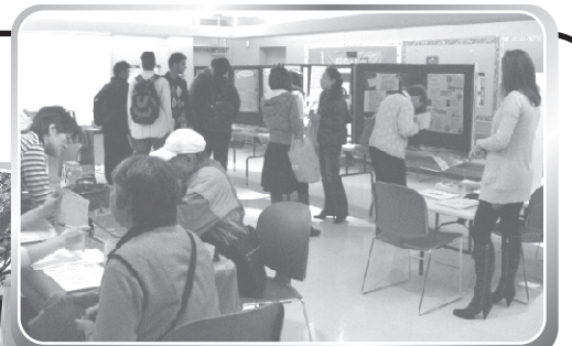
First Library Settlement Day at Milliken Mills Library