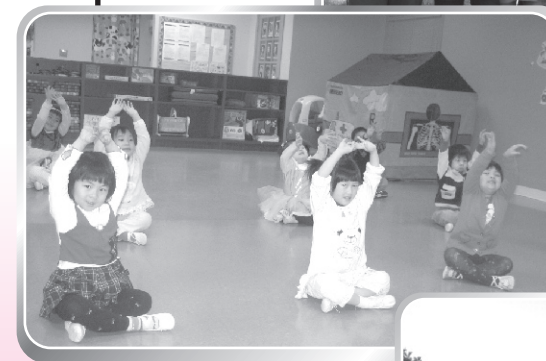
Early Years Dance Group